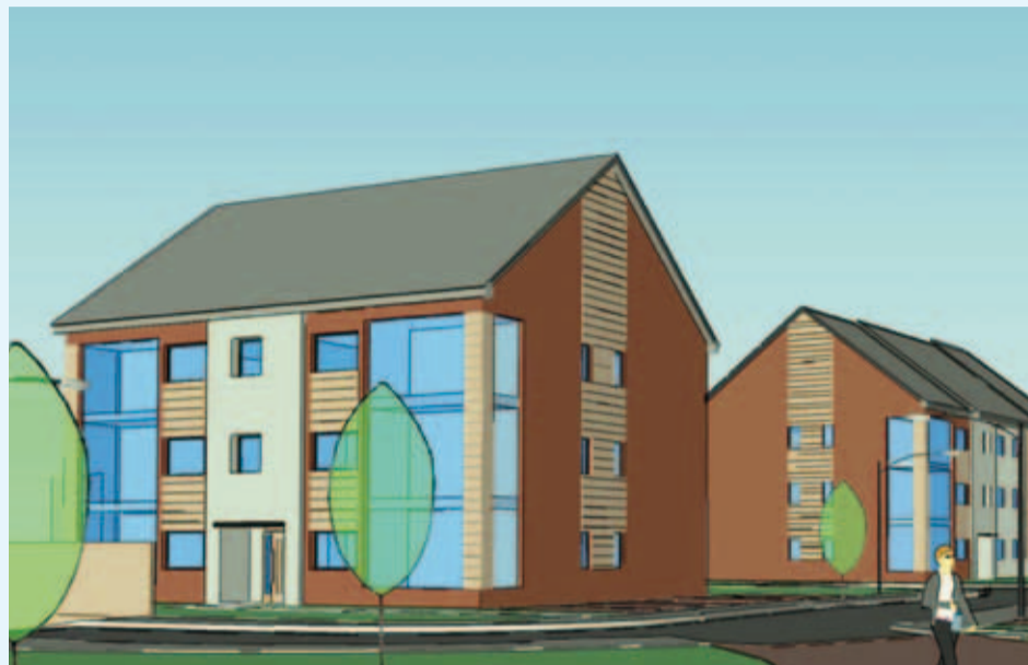
Artist's Impression of potential flats at the Broomlea School site.

Partick Housing Association has recently concluded the purchase of a site in Broomhill from Glasgow City Council, represented by their agent, City Property Glasgow LLP. The site, which included the former Broomlea School building, has now been cleared and site investigation works are on site.